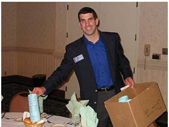
Jon Malkovich busy at working setting out the latest Research data