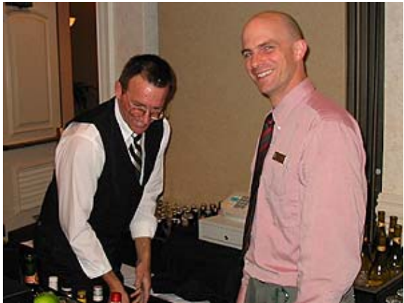
Our Hosts for the evening from the Embassy Suites