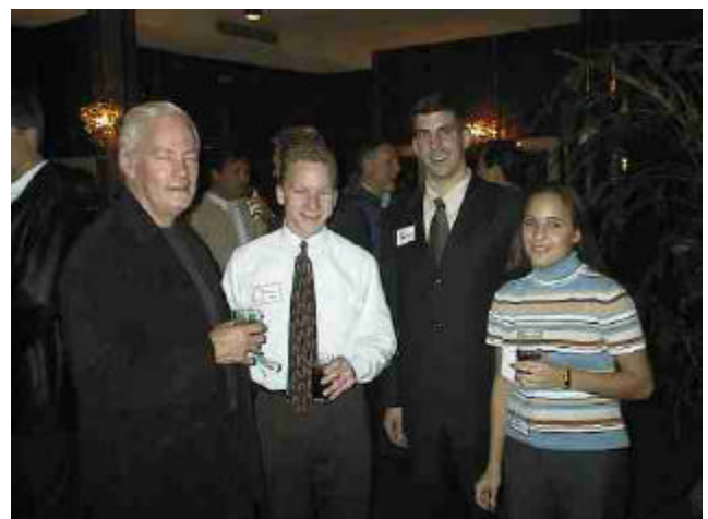
Say Goodbye to the World Trade Club